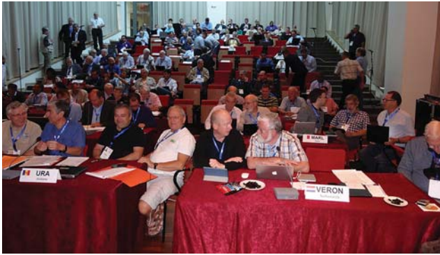
General view of the Final Plenary.

The International Amateur Radio Union is the 'umbrella' organisation for national radio societies around the world. It is organised into three Regions, reflecting the ITU Regional Structure. Each Region has a General Conference every three years. In 2014, it was the 23rd General Conference of IARU Region 1 that opened on Sunday 21 September with 43 Member Societies present in person and 17 Member Societies represented by proxies. Representatives of radio amateurs living in Europe, the Middle East and Africa met to agree and coordinate activity to safeguard and develop the future of amateur radio. IARU representatives from the Americas (Region 2), Asia-Pacific (Region 3) and the IARU International Secretariat, along with representatives from amateur radio societies in Kosovo and Tunisia, attended as observers.