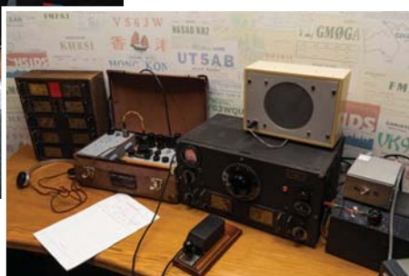
The Para-Set and HRO installed at the National Radio Centre.