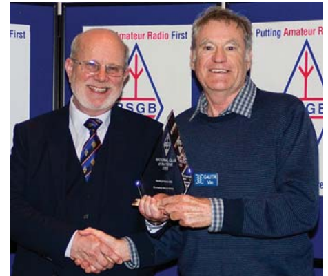
Reading & District ARC won the National Club of the Year trophy for 2013 and were presented with their cheque at the AGM. Will it be your club next?