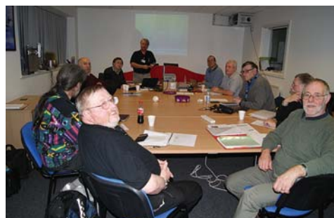
Some of those who attended the exam question workshop in Sheffield.