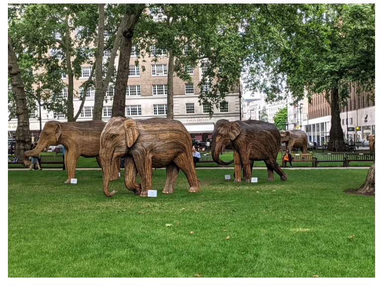
These elephants are made of bamboo and they were part of an exhibition held in 3 separate London parks that finished on the 31/07/21