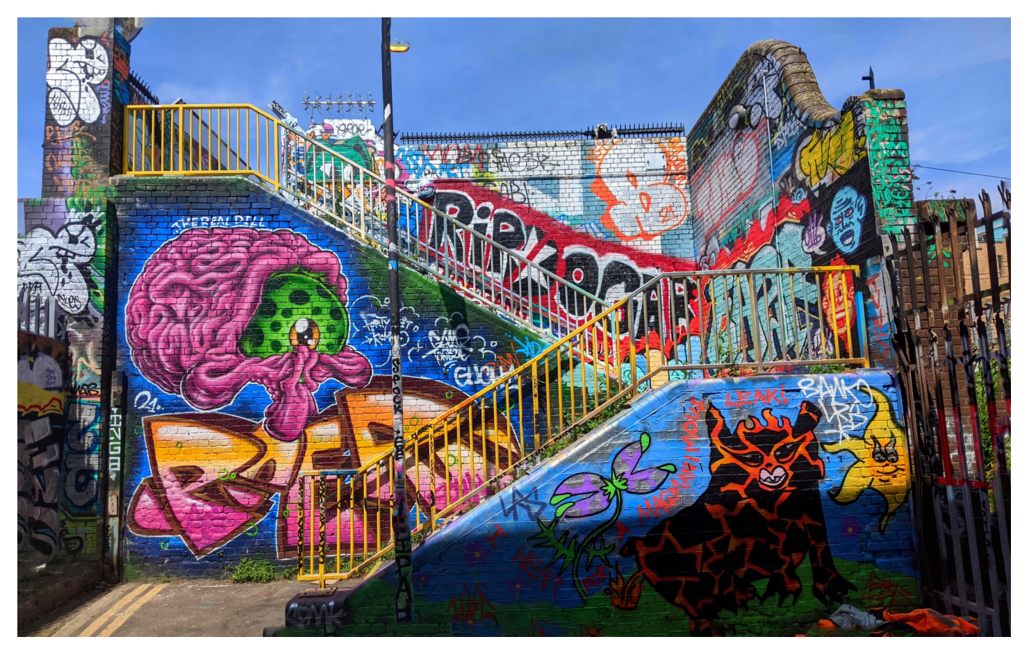
Above A railway crossing in East London (opinions please) Below Me in a desolate place on a sunny day (that's rare)