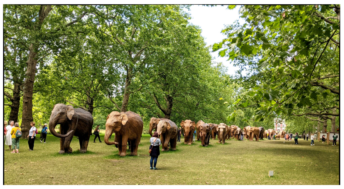
Above Elephants in Green Park