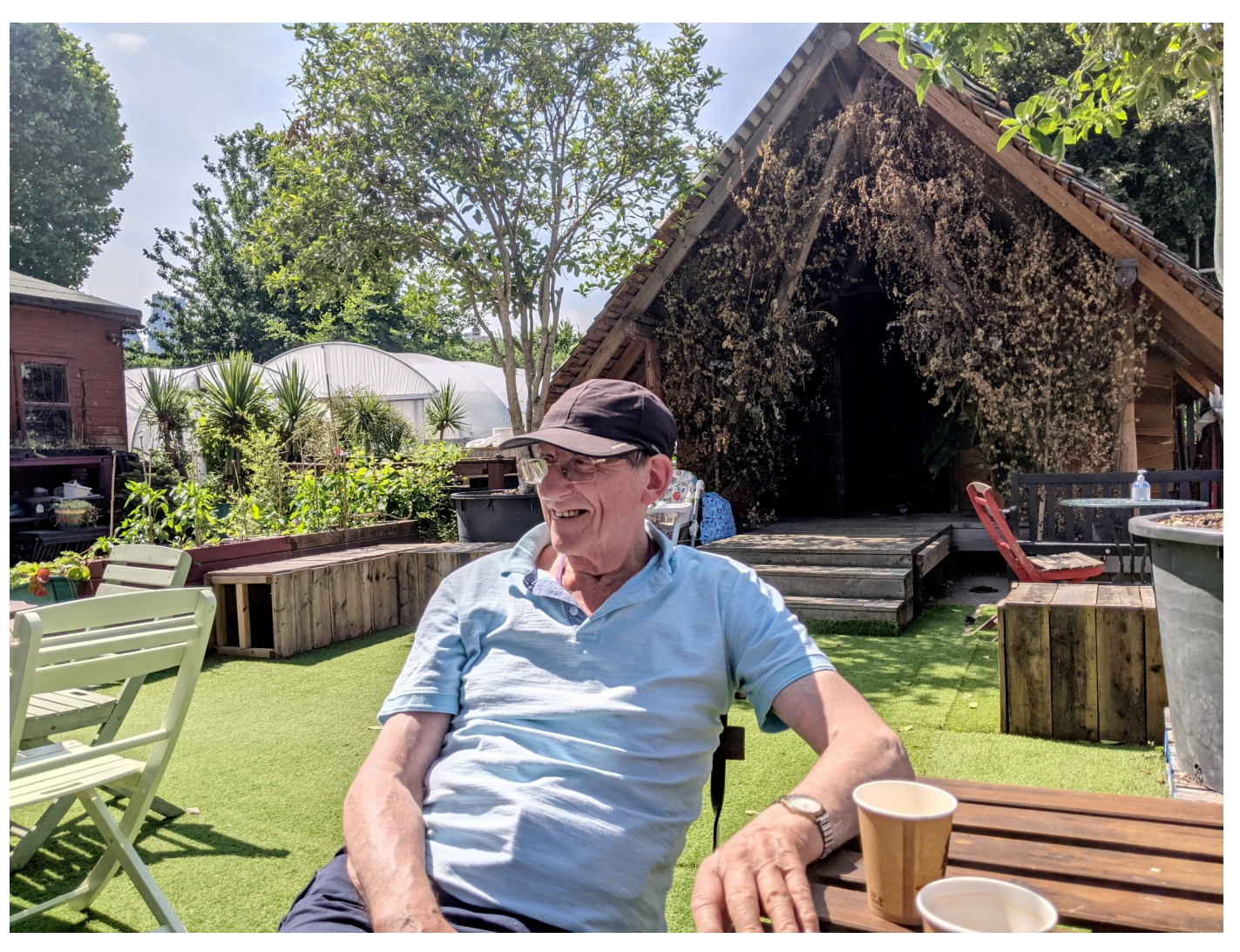
Page 9 of 9