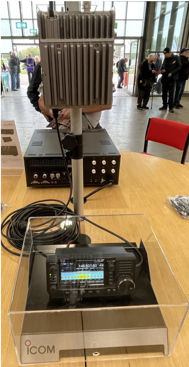
The Icom IC-905 with mast head amp.

I was keen to visit a major radio rally after the lack of them during Covid. In fact the Hamfest was the last major rally I had attended back in 2019. Living in deepest Suffolk I am now much closer to this event. The drive up to Nottingham being comfortably less than two hours. However I stayed overnight before the Friday for health reasons. On arrival at the Newark Showground I found a very long queue which I was able to circumvent with thanks to the many event staff on duty.