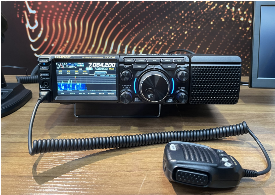
The Yaesu FT-710 Aess with SP40 speaker.