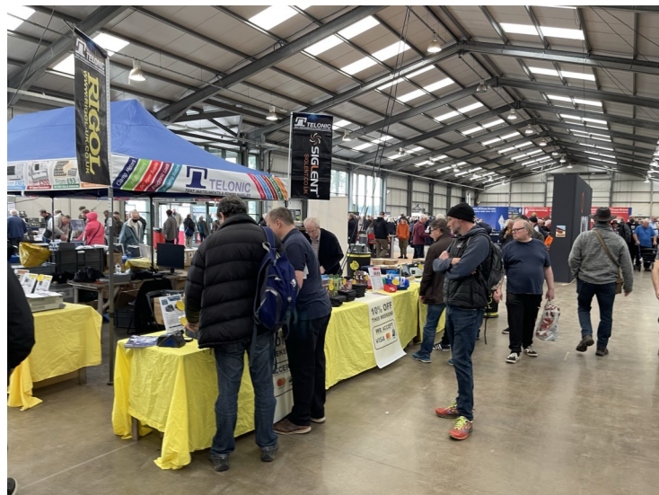
Lots of space for traders to sprawl out and for visitors to walk freely.