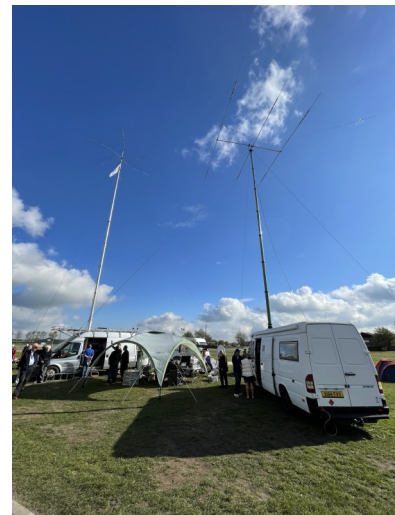
An FT-8 group, Es'hail 2 / QO-100 and other HF operators.