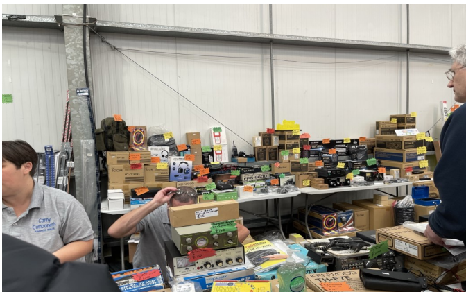
Plenty of bargains (and junk) on offer.

After a break I made my way round to Yaesu to see their big release of the year - The FT-710 Aess, a compact HF transceiver with 3D scope and a Bose style ported speaker which comes supplied with the radio and provides enhanced audio. Speaking to the Yeasu service engineer I was told their next radio would likely be a more transportable one with the 3D scope and V/UHF so a likely successor to the FT-991/A. Expect that in 2023 too!