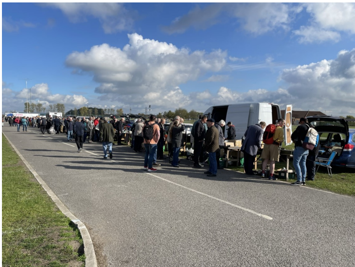
Some of the many outdoor traders.